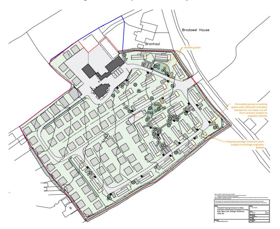
Figure 2 – Proposed Site Layout

The proposed scheme now comprises 25 static caravans that will be positioned to the front of the site and will run along the south-eastern boundary of the site. Each static caravan will be served by its own parking space and amenity space with proposed landscaping between each pitch. The rest of the site will be retained for touring pitches as existing.