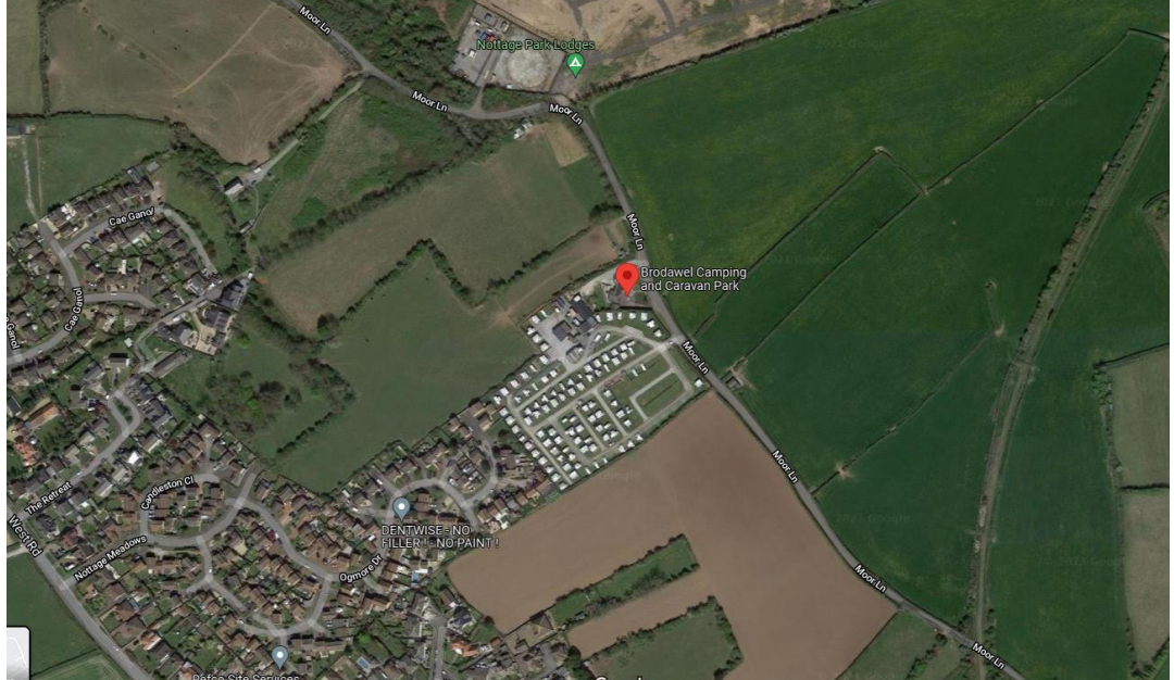
Figure 1 – Aerial Photograph of the Application Site and Surroundings

Initially the application proposed the change of use of 125 touring caravans to 50 static caravans with associated infrastructure improvements and ecological mitigations and enhancement. Following a number of concerns raised by the Local Planning Authority (LPA) regarding the loss of touring pitches at the site and highway safety concerns, an amended scheme was submitted on 10 May 2021 which proposed the change of 25 touring caravans to 25 static caravans and the retention of 68 touring pitches with a revised Transportation Statement for the site submitted on 2 September 2021.